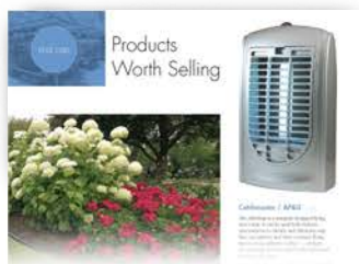
Photo plus a 50 word description with your phone number and website in Today's Garden Center magazine.

Deliver your sales and marketing message to over 20,000 buyers. END CAP reaches them on every media platform they use to gather information. Whether you have been targeting garden centers or this is a new market for you, END CAP provides an incredible amount of exposure with a minimum purchase of $350. Contact your sales representative below for more details.